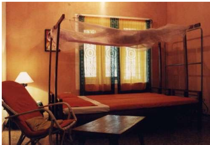
Accommodation at VKV